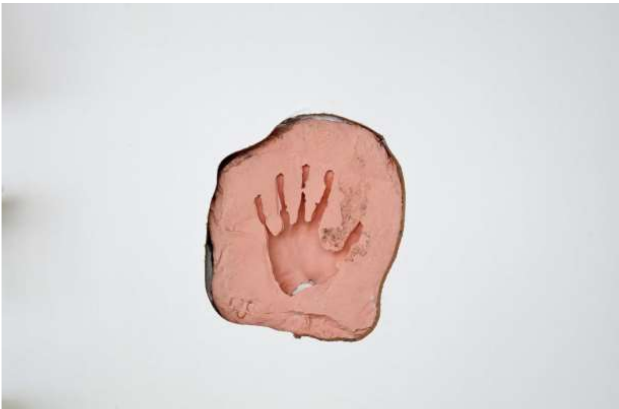
Installation during AFAD Prieskum (13. 12. – 15. 12. 2019)