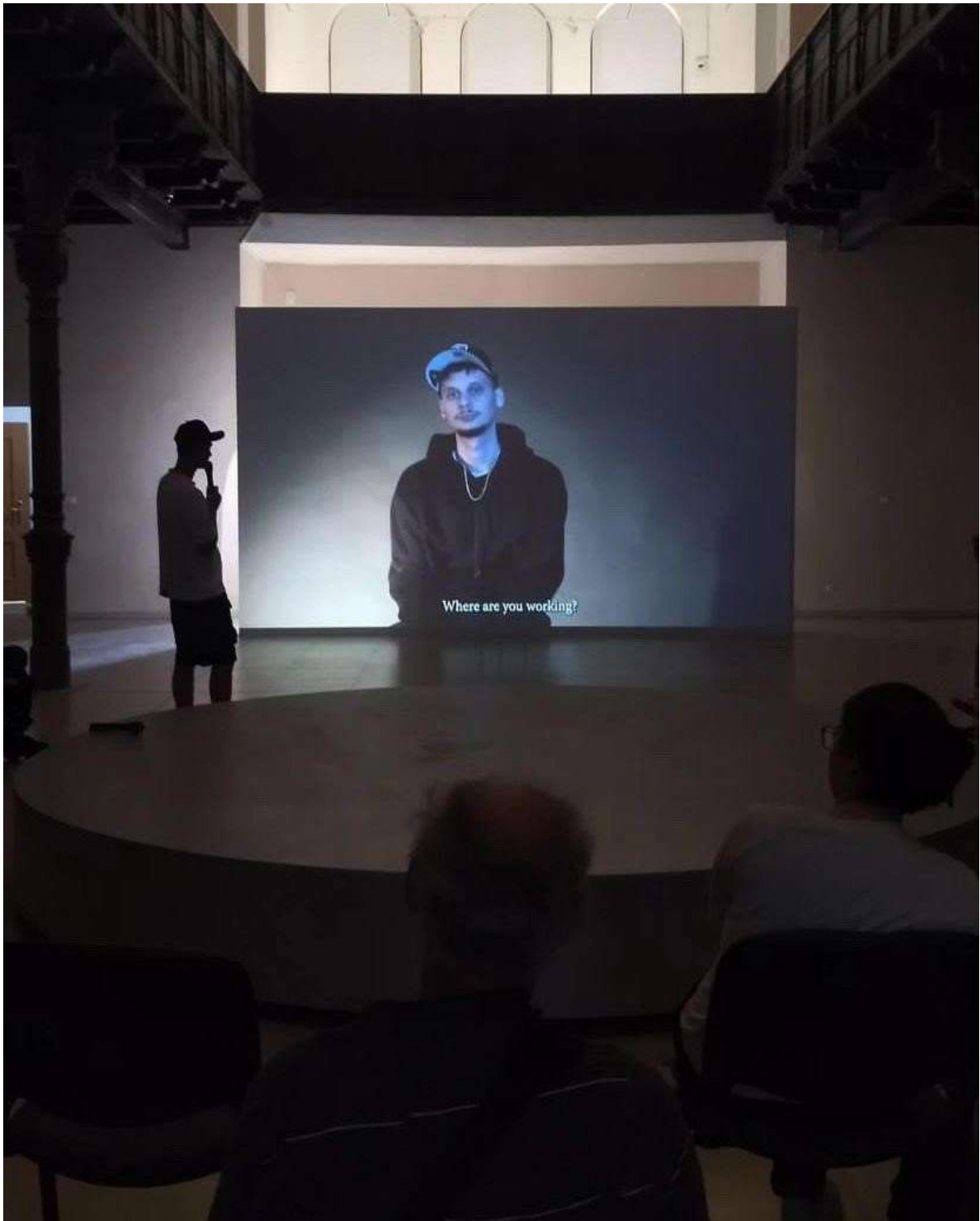
Installation during the Studio Intermedia (Academy of Fine Arts) department presentation at Synagogue – Centre of Contemporary Art in Trnava (25.05.2023)