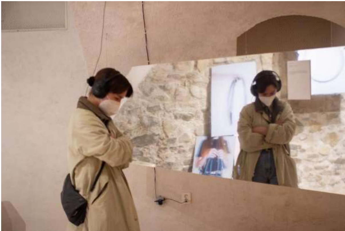
Installation during the exhibition „Shared imagination“ at Galleries of the city of Bratislava, Pálffy palace (28. 05. – 29. 08. 2021)