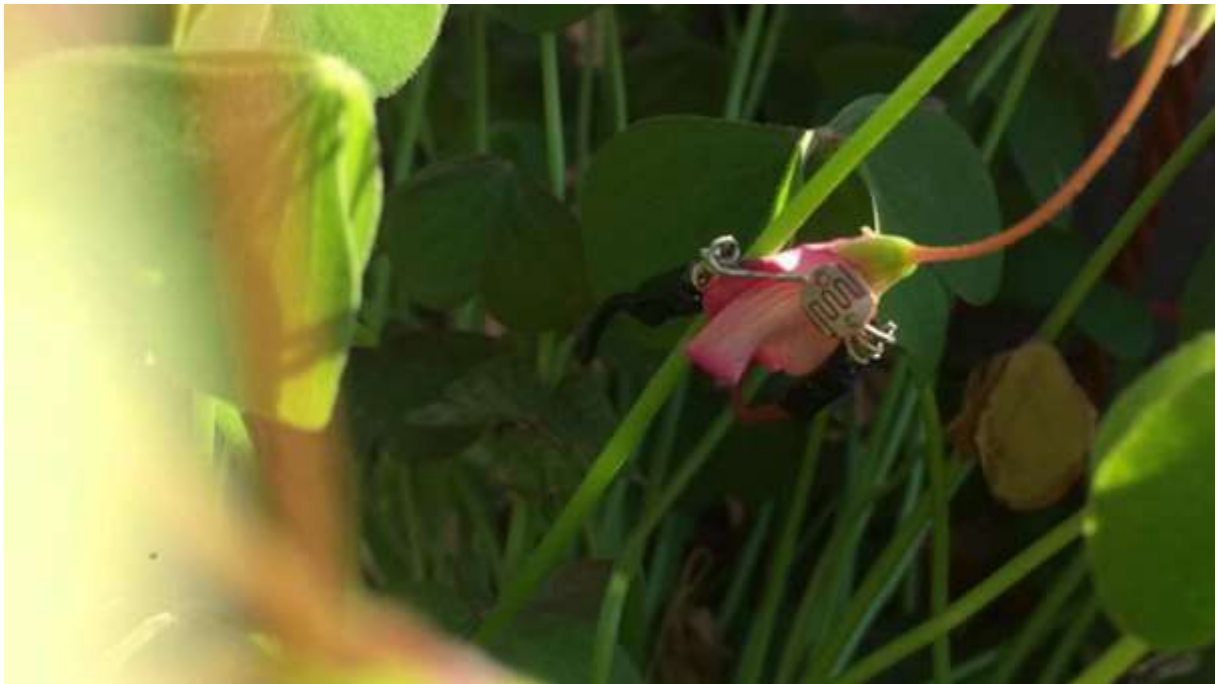
Screenshot from the video