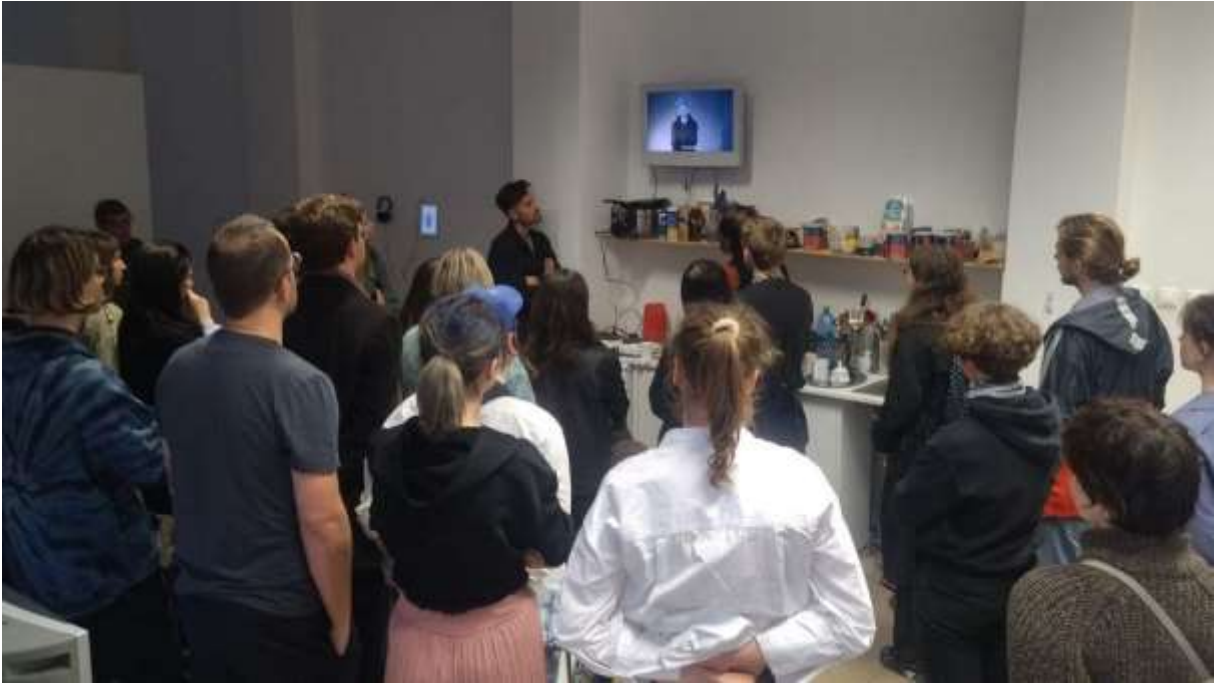
Instalation during VSVU Prieskum (19. 05. – 21. 05. 2023)