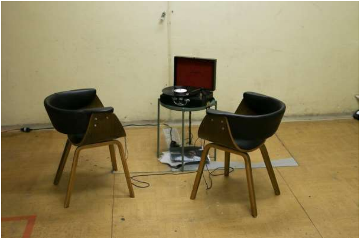
Installation during the exhibition „Openness“ at Arta, Piešťany (15. 12. – 15. 02. 2021)