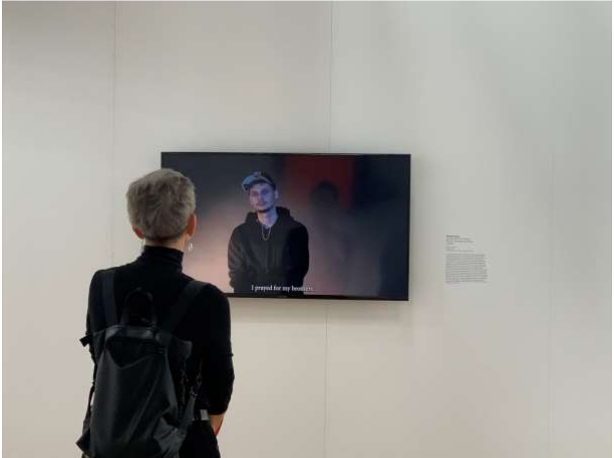
Installation during Art Market Budapest (19. 10 – 22.10. 2023)