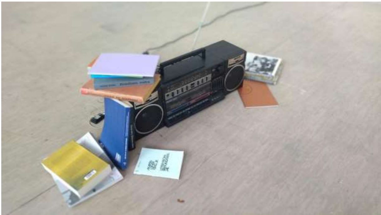
Installation during VSVU Prieskum (20. 05. – 22. 05. 2023)